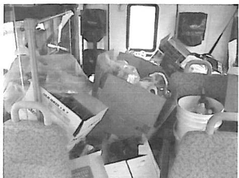
Our new bus, full of bottles on it's most recent trip to the bottle depot.

The new bus is going out multiple times per week and the residents are so enjoying it!