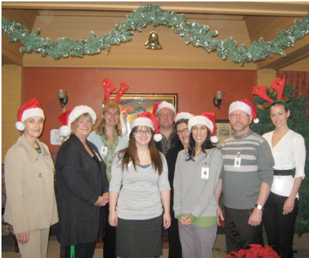
Seasons Greetings from Inglewood's Leadership Team!